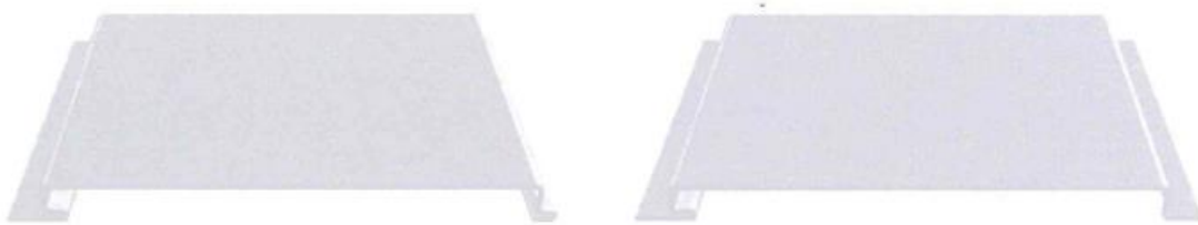
Figure 4: SP - GI DIVIDER PROJECT REFERENCE PHOTOS